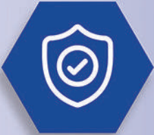
Advanced allergy protection