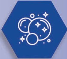
Protection against contamination