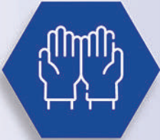
Superior comfort and easy donning to the wearer