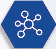
Excellent sensitivity and grip