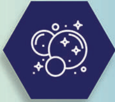
Protection against contamination