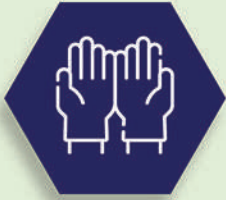
Superior comfort and easy donning to the wearer