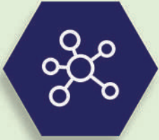
Excellent sensitivity and grip