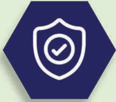
Advanced allergy protection